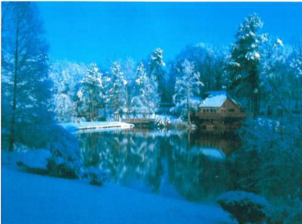
Mainstreet Clubhouse on the Lake "WALKING IN A WINTER WONDERLAND"