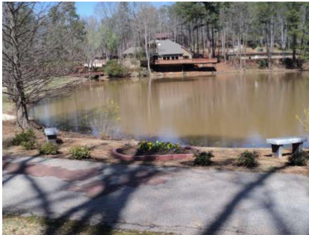
Mainstreet Clubhouse on the Lake