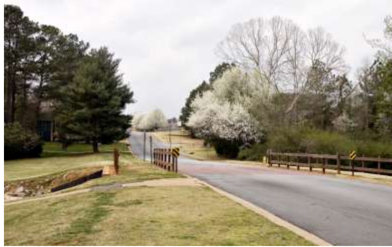
Mainstreet Park Drive