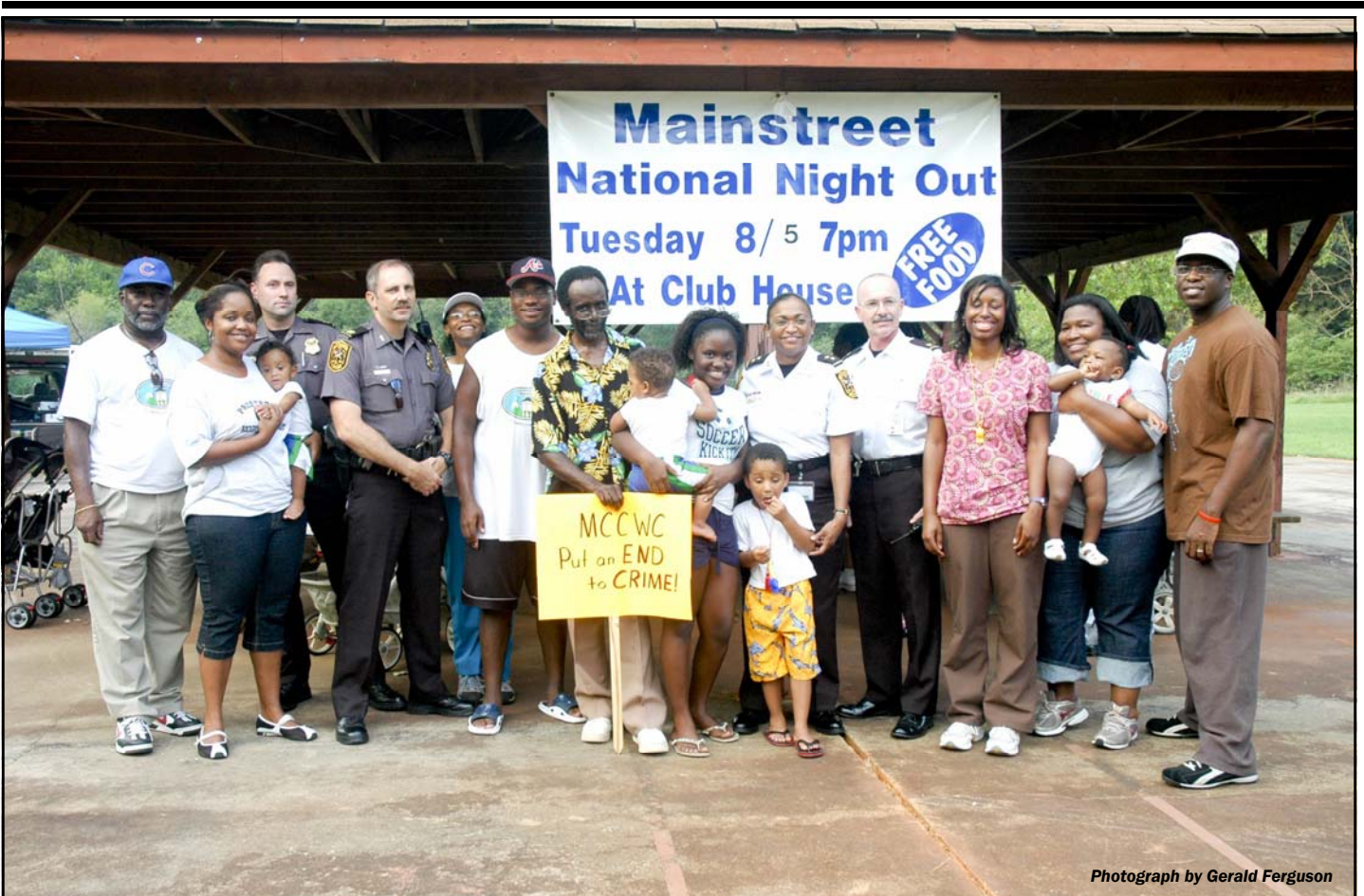
Photograph by Gerald Ferguson